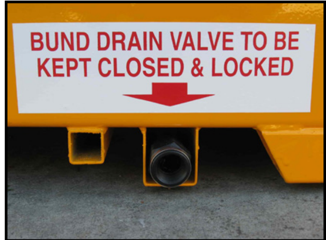
Above Right: Example of a Storemasta bund/sump drain valve on an outdoor Corrosive Substances storage unit.