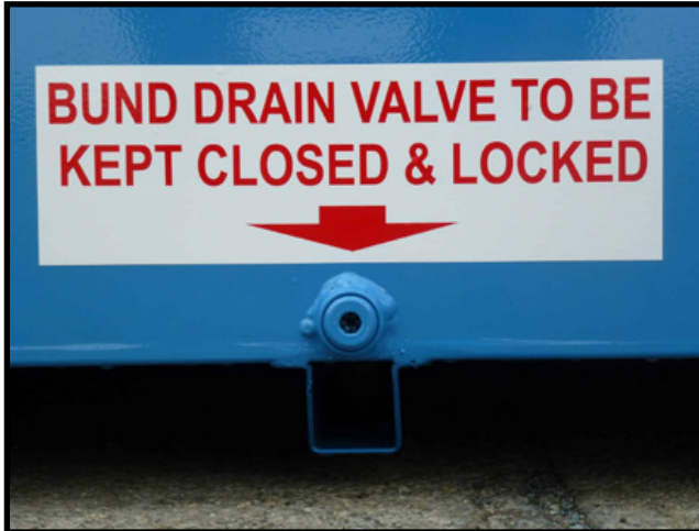
Above Left: Example of a Storemasta bund/sump drain valve on an outdoor Flammable Liquids storage unit.

This can be done using the ½” BSP drain located at the front of your container, or alternatively, the waste liquid can be pumped out and disposed of by any waste management company.